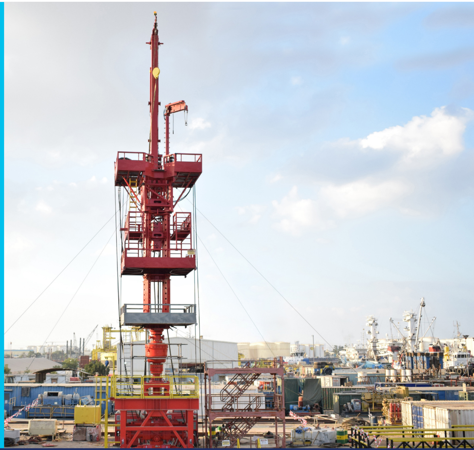
340K ADVANCED HYDRAULIC WORKOVER UNIT